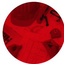
ENGINEERING AND ARCHITECTURE