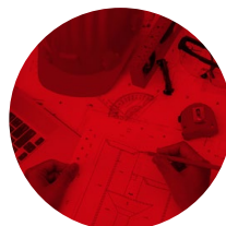
ENGINEERING AND ARCHITECTURE